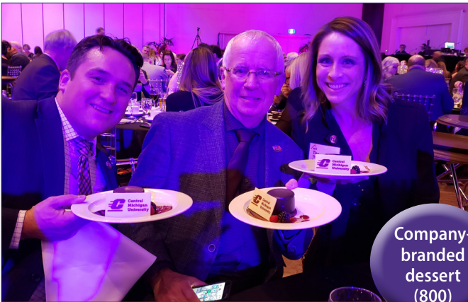
Company-branded dessert (800)