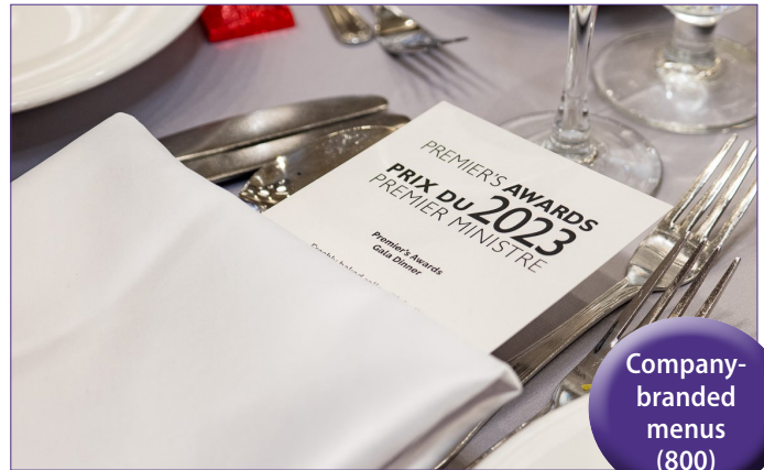
Company-branded menus (800)

1 To be included in printed materials, all graphic materials and your company's completed ad must be submitted by October 4.